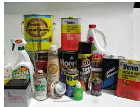
Household Hazardous Waste- ask for details Paints & Stains (fees)