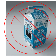
Wax covered cartons