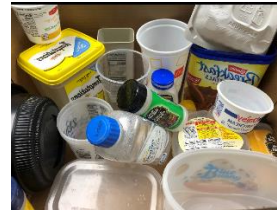
#5 tubs, trays, cups