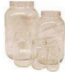
Clear glass jars