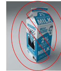
Wax covered cartons