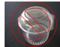
#1 plastic trays