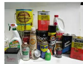
Household Hazardous Waste