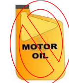
Motor oil containers