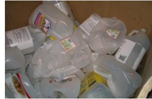
#2 natural bottles