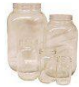
Clear glass jars