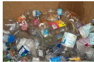
#1 plastic bottles