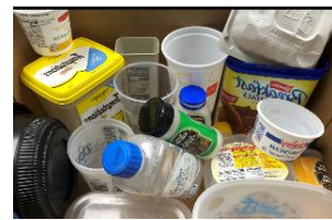
#5 tubs, trays, cups