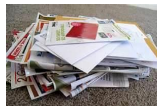
Paper / Junk mail