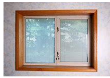
Window glass (no frames)