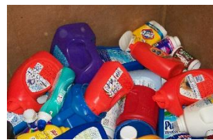
#2 colored bottles