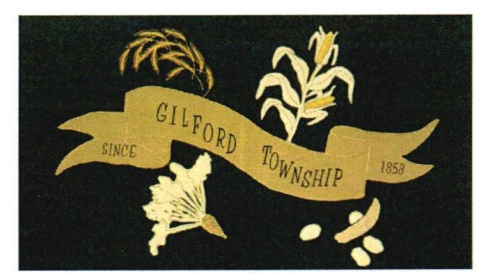
6230 Gilford Road, Fairgrove, MI 48733