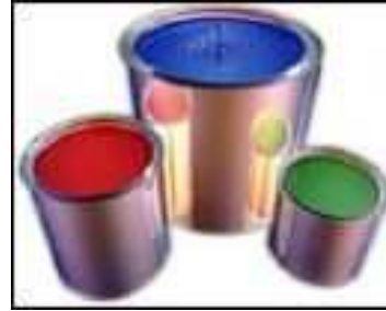
Dispose of your oil based paints at one of our hazardous waste collections