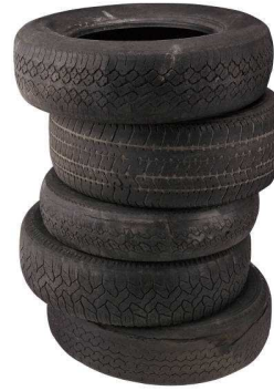
Tires accepted year round