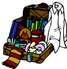
All items donated to Salvation Army must be usable items

*All types of clothing, linens and bedding are acceptable.