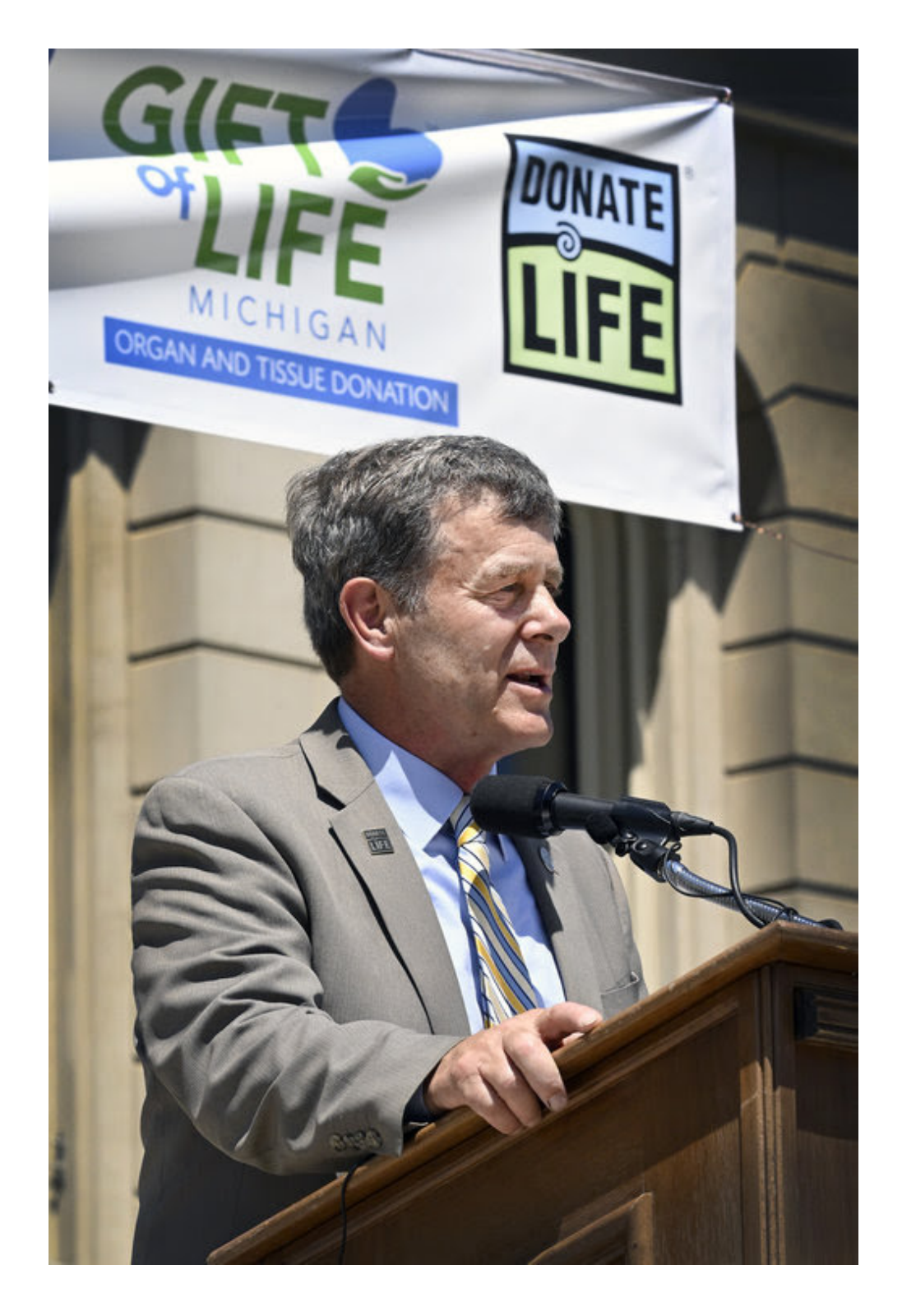
Page 37 of 44

To learn more about Gift of Life Michigan or how you can register as a donor, visit <u>GiftofLifeMichigan.org</u>.