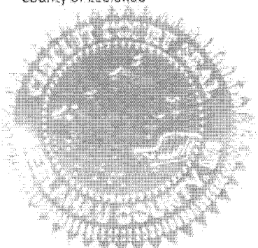
State of Michigan County of Leelanau