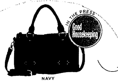
SIGNATURE BARREL Faux Pebbled Leather. 13.5°W x 8°H x 6°D.